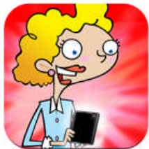
Don't Forget to Mark These Dates in your Calendar!

There is many activities taking place this month... Please make sure you include the following activities onto your calendar: